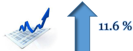
Major Taxes Through May FY2017 versus FY2016 (in $Millions)